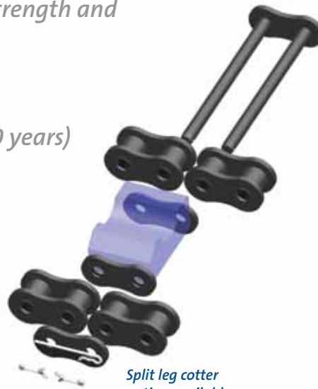
Split leg cotter option available