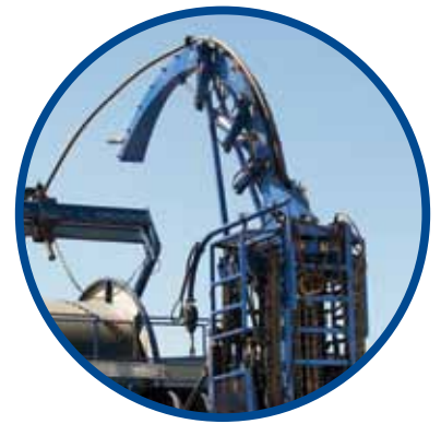
Count on Renold injector chain for uptime and reliable performance in the field.